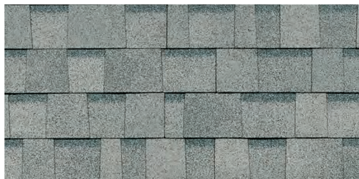
Antique Silver †

Home is where you want to feel the most comfortable and protected. It can be a source of pride and an expression of your personality. But when the time comes to purchase a new roof, it's easy to feel overwhelmed. Don't worry. Owens Corning Roofing and your contractor are here to help. We'll make it easy for you to select the right shingle for your type of home and sense of style. You can feel confident about choosing our roofing products. After all, we take pride in being America's most trusted Roofing Brand. §