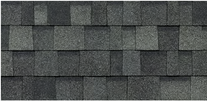
Estate Gray †