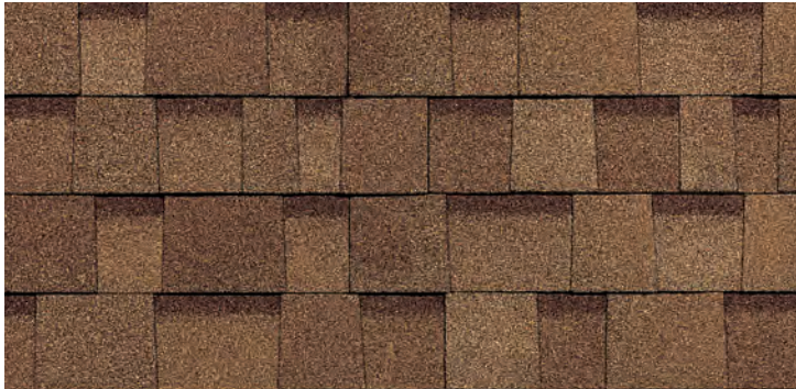
Desert Tan †