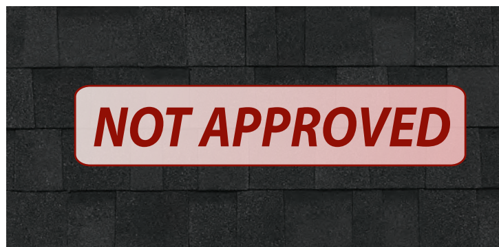
Onyx Black †