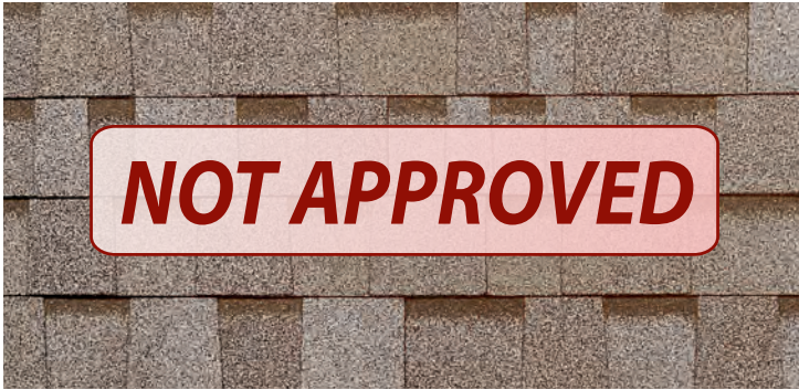
Beachwood Sand †