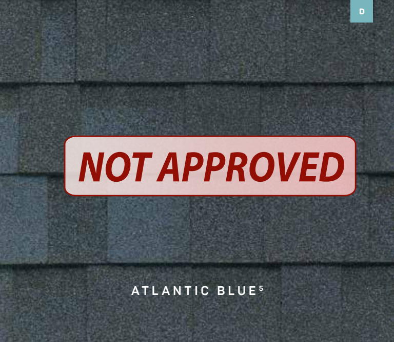
ATLANTIC BLUE 5